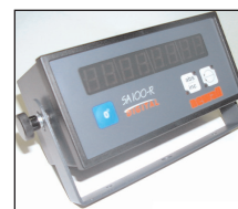
Desktop or Support Mounting Arm