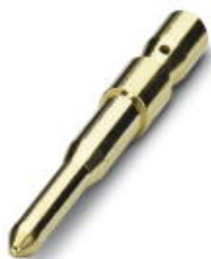
Crimp contact, leading (PE), turned, contact diameter: 1.5 mm, crimp range: 0.5 mm 2 ... 1 mm 2

Please be informed that the data shown in this PDF Document is generated from our Online Catalog. Please find the complete data in the user's documentation. Our General Terms of Use for Downloads are valid ( http://phoenixcontact.com/download )