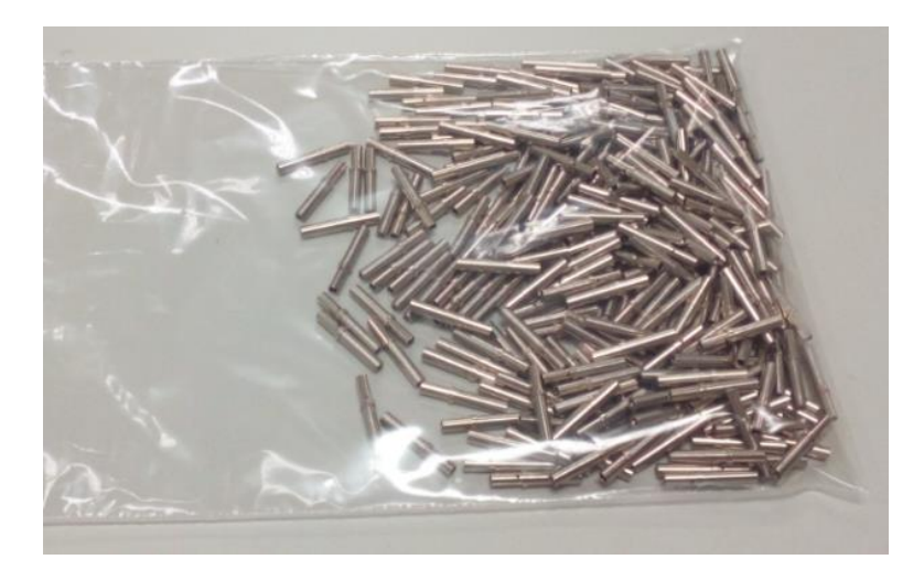
Figure 1: Components Placed in Bag