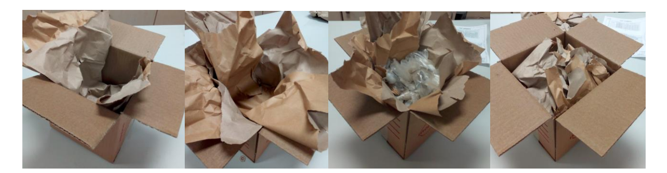
Figure 2: 'Paper Void Fill' encapsulating the bags of contacts inside the Carton.

2 sections of 'paper void fill' are used to line the sides and bottom of carton 967070005. The paper filling can be long enough to encapsulate the bags of terminals, at the top of the box. A separate section of paper could also be used to cover the bags at the top of the box to remove any free space.